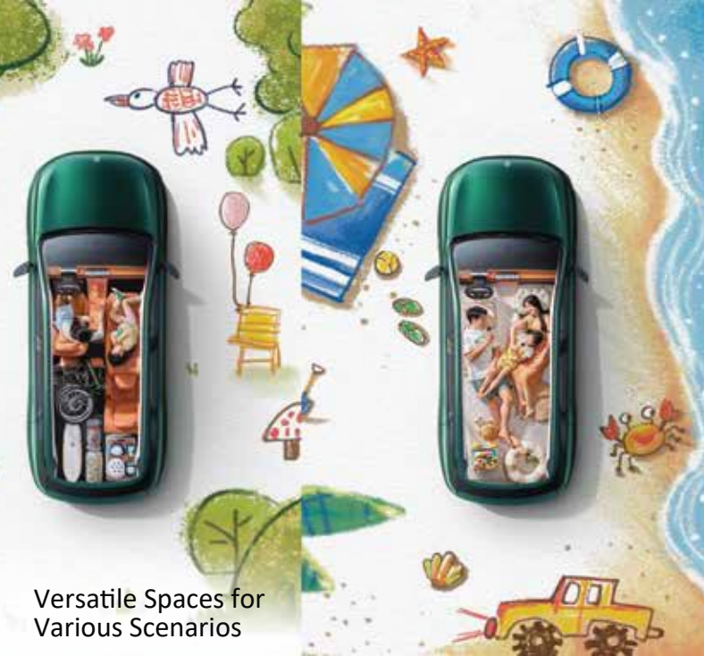
Versatile Spaces for Various Scenarios