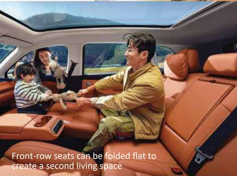
Front-row seats can be folded flat to create a second living space