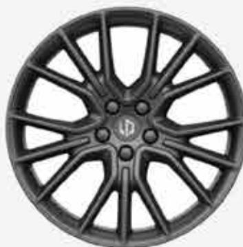
Trident sporty wheel 20-inch wheels for ultimate sportiness