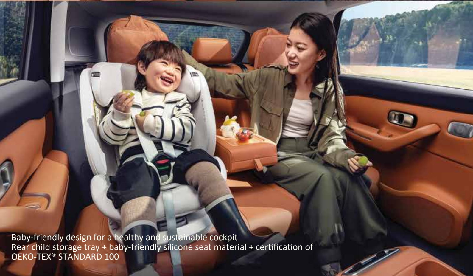
Baby-friendly design for a healthy and sustainable cockpit Rear child storage tray + baby-friendly silicone seat material + certification of OEKO-TEX® STANDARD 100