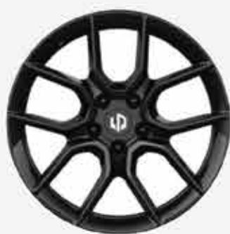
Double five-spoke wheel 18-inch wheels, lightweight and efficient